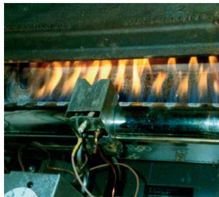
A yellow or orange flame may mean carbon monoxide is present