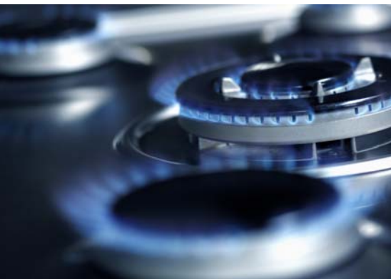
A healthy flame - crisp, vibrant and blue